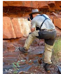
Photographing petroglyphs near Kalamina

upstream back into the wilderness which we should have to ourselves. If you want an amazing experience, you can take a big short cut and swim about 200 m through the gorge to get back to dry land back toward camp. To do this, you'll need a dry bag for your boots & clothes). The alternative is a longish walk back up the tourist track, then cross country to where we can climb down into Knox above the swim.