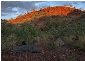
Sunset, Munjina camp

Our local transport picks us up from our accommodation in Tom Price for a drive of about 150 kilometres to the edge of Karijini National Park where we begin a one week walk combining the Munjina and Dales-Dignam gorge systems. This will be much the same as the walks we did on our last Karijini trips in 2009 and 2010.