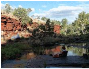
Knox Gorge campsite

Kalamina is one of the most underrated gorges in the park. If time permits, we will spend two nights at our Kalamina campsite and do a day walk exploring further down the gorge. We then follow one of Kalamina's tributaries past a major art site up onto the plateau and head across to the headwaters of Knox Creek and downstream to a secluded camp at the very head of Knox Gorge.