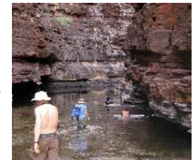
Starting the Knox Gorge swim

Next day, from our Knox campsite, we continue straight across to Wittenoom Gorge and do a day walk from there. This section finishes with the climb out of Red Gorge and a walk across to the Weano car park. If time permits, you will be able to explore the tourist tracks in Weano and/or Hancock Gorge.