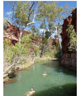
Munjina swim, less than two hours from the start of the walk.

A short walk from the highway along a dry creek bed brings us to Munjina Gorge and the first of the many lovely pools and waterfalls we encounter. White tree trunks against a background of red rock and a deep blue sky are everywhere around us. Some of the walking is quick and easy, some is slow and scrubby. The ever changing landscape contains more than enough to keep us happy. We expect to do a very short walk to a base camp on the morning of day 2, followed by a walk without packs for the rest of the day.