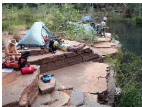
Dales Gorge campsite

Dales Creek flows through a large gorge. It is fed by a number of small creeks, many of which have their own gorges, each with its own character. Dignam is by far the largest of these. Some groups have spent little time in Dignam; others have spent a full day. We are still exploring and hope to camp well up the gorge on this or some future trip. There are other potentially interesting side gorges which we may explore as well as or instead of Dignam.