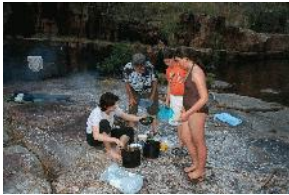
Three generations about to have dinner, first camp.

We begin with a four to six hour, 350 kilometre drive from Darwin. The last 45 kilometres is on a 4WD track which is so rough that it can take over two hours on its own. From the parking area, a relatively easy three kilometre walk across some fairly flat ground brings us to a lovely pool and our first camp site.