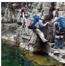
As hard as it gets. On this trip an 8 year old had done the same step a few minutes earlier.

There are a few places where you have the choice of edging along narrow rock ledges (close to water level, no big drops), floating your pack through the creek, or climbing up and around. The last 500 metres alone often takes two hours or more as the deep pools and a natural water slide are much too inviting to pass by in a rush.