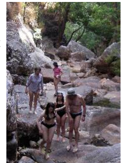
Walking up one of the shady gorges.