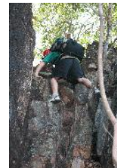
The climb out of the gorge is and looks hard, but he was only 8 and he did it unassisted.