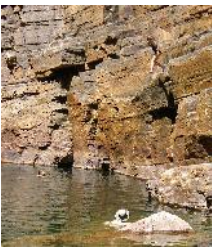
The children can seldom resist jumping onto a pool. Their parents almost always join them.

The two main gorges at Graveside contain some of the nicest monsoon forest in Kakadu. We usually spend most of a day exploring the gorges, enjoying the shade and relaxing in and around the large pools below the waterfalls at the tops of the gorges. It's a bit of a scramble to get up the gorges but the large, deep pools at the top of the two gorges make it more than worth while. Swims are almost always too much to resist for any member of the family.