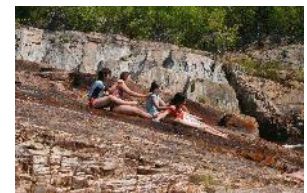
Most go down the slide by themselves. The four here decided that more together meant more fun.

The loop described above may be done in either direction.