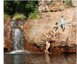
Swim at first camp